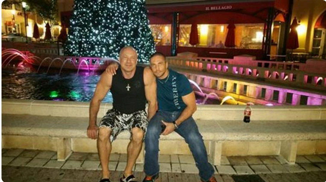
Thank you for the wonderful 6 years' journey and for showing me the meaning of true love and devotio